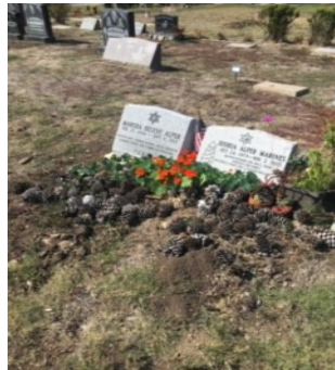
PACIFIC GARDEN CHAPEL AND WATSONVILLE / SANTA CRUZ

ARE YOU A MILITARY VET AND LOOKING FOR INFORMATION? GO TO: www.benefits.va.gov