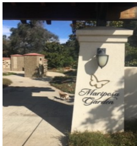
Santa Cruz Memorial / Oakwood